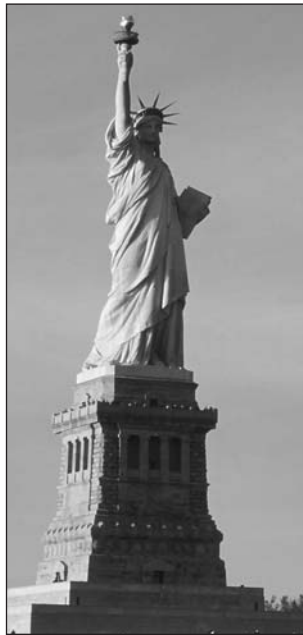
Statue of Liberty