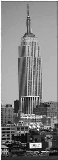
Empire State Building

time exploring the 16.3 acres of The Lincoln Center for the Performing Arts. Absorb the beauty of The Guggenheim Museum, as much a work of art itself as the treasures it houses. Be amazed by the dinosaur halls in the American Museum of Natural History, or take a few moments to remember at the World Trade Center Memorial. Perhaps an afternoon with an espresso or a glass of wine at a Greenwich Village sidewalk cafe is more your style. However you choose to enjoy New York – sightseeing, exploring or just relaxing – it will be an amazing three days!